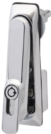
Photo shows handle with 211-9106 profile cylinder (sold separately)

* Stainless steel range refer to page 5-29