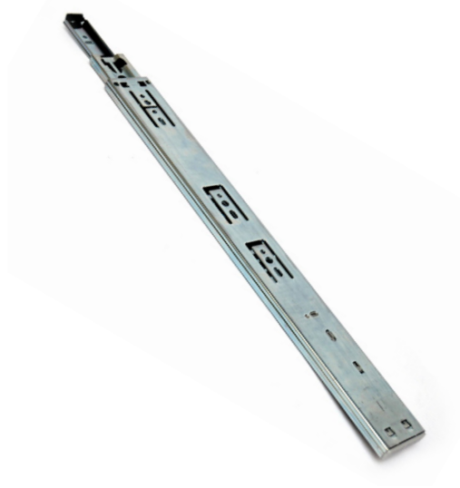
Also available in stainless steel